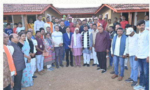
Inauguration of Tribal Homestays in Gumtara, Madhya Pradesh