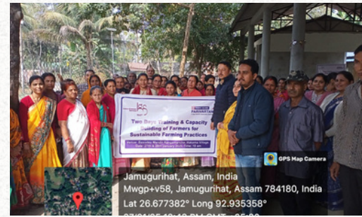
Activities under the HIGHLAND Project, Northeast