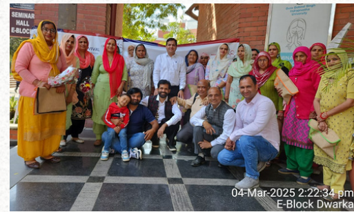
Launching of Rawta's Green Revival project at Rawta, Delhi