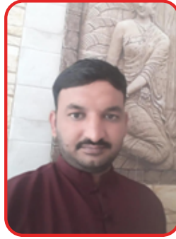
Chhatrapati Atmaram District Head