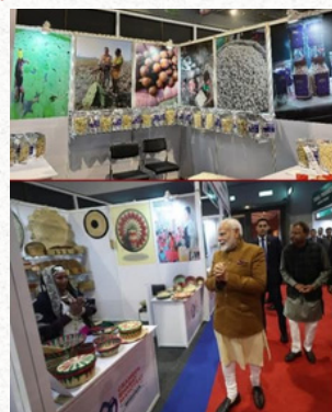
Participation of Nauhataa FPC at Grameen Bharat Mahotsav 2025, Delhi