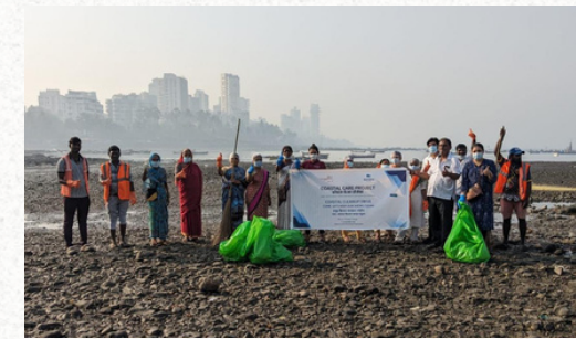
Activities under the Coastal Care Project, Mumbai