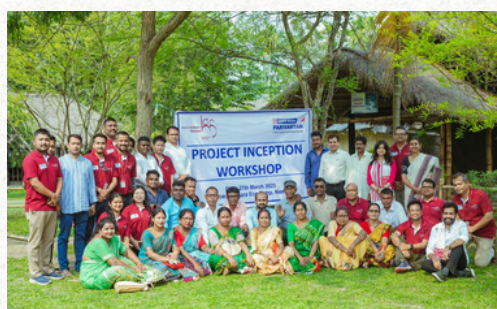
Inception Workshop under Project HIGHLAND, Northeast