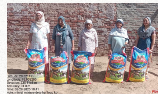
Distribution of mineral mixtures to the women farmers under Rawta's Green Revival project at Rawta, Delhi