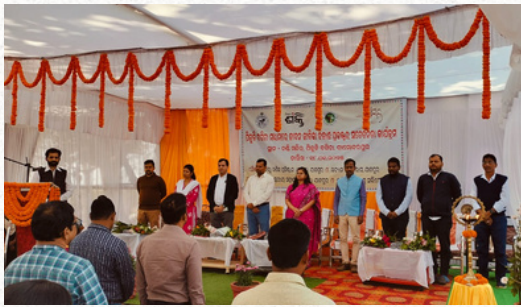
Launching of Guava Orchard Management Project at Jajpur, Odisha