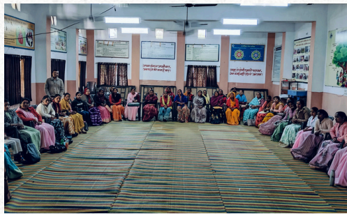
Training program under the Harit Bharat Project at Narmadapuram, MP