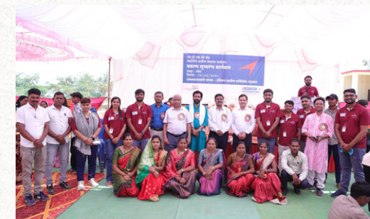
Launching of Project SAAKSHYAM at Nandurbar, Maharashtra