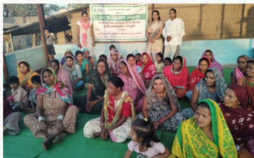
Awareness Activities under Samruddha Kisan Project, Nandurbar, Maharashtra