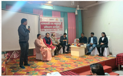
Convergence Meeting under the Shwethdara Project at Pipariya, MP