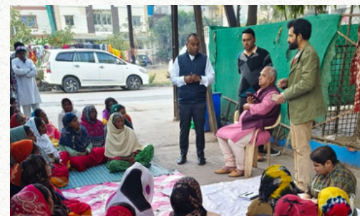
The IGS team led by our Co-Founder spent time with the Ragpickers community at Anna Bhau Sathe slum, with whom IGS worked during 2007-2012